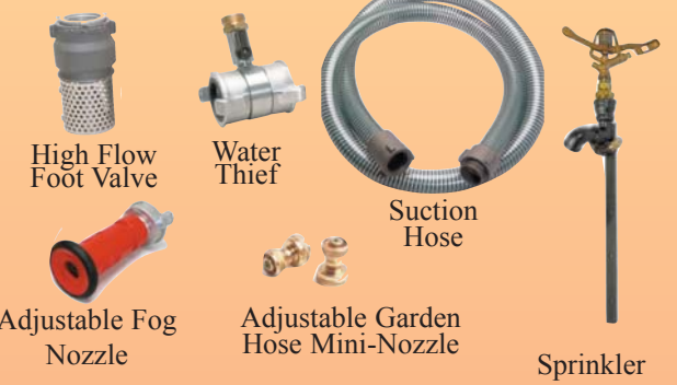
High Flow Foot Valve