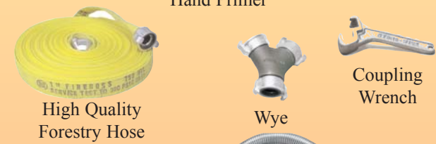
High Quality Forestry Hose