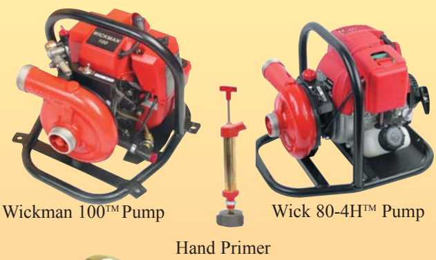
Wickman 100™ Pump